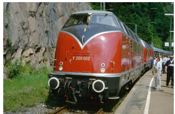
V200 at Triberg

Our full-colour magazine Merkur is published quarterly and we cover all periods of the prototype, from the earliest to the current era. We try to circulate as much information on news, developments and stock changes as possible. There are articles on prototype and modelling subjects as well as information about the Society, exhibitions, news of the model trade and a 'sales and wants' section, free to members. There is also an e-group available to members.