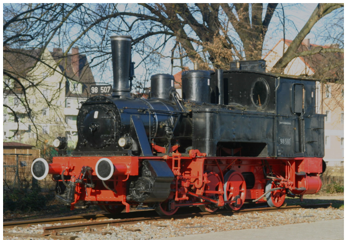
Class 98.4-5 (bay. D XI) at Ingolstadt

The GRS offers a write-in Help Service for those new (and not so new!) to German railways. This is a useful way of answering those small but important questions such as why, how and when!