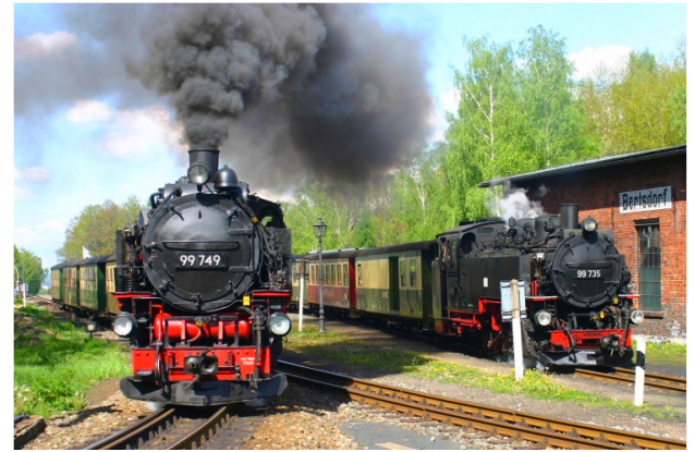
Two Class 99.73-76 at Bertsdorf

The Society has a number of local groups in the UK where there are a sufficient number of interested members living within a reasonable distance of each other. Meetings are organised by the members of the group and cover all interests. Some local groups are forming 'twinning' links with railway/model railway clubs in Germany. If you decide to join us and indicate an interest in a local group, the Local Group Co-ordinator will contact you to let you know if one exists in your area.