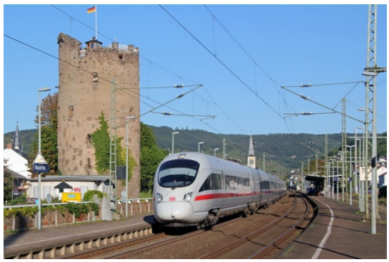
ICE T at Boppard