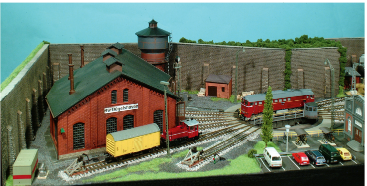
HO Model Depot Dügelshaven